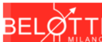
Figure 9: Internationally recognized brands that produce AVRs