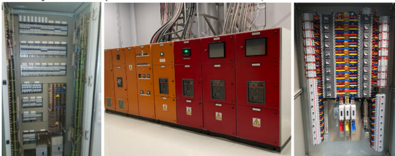
Figure 6: Well-constructed enclosure examples from BHI's work